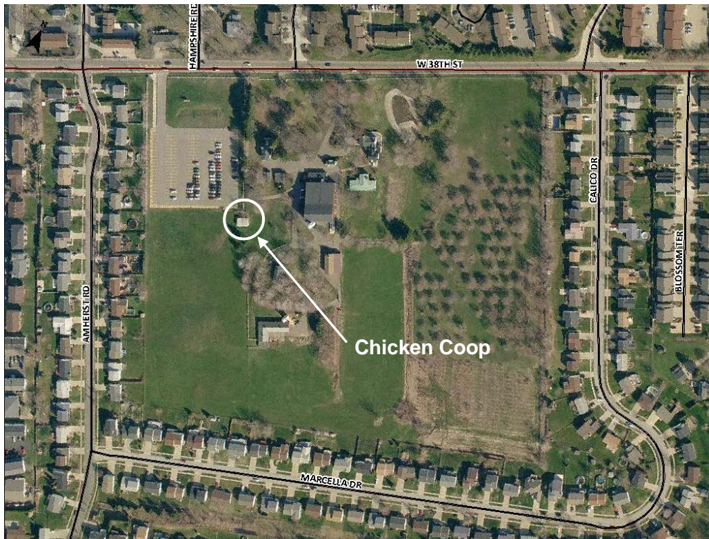
Porreco College (Erie Campus) Edinboro University of Pennsylvania