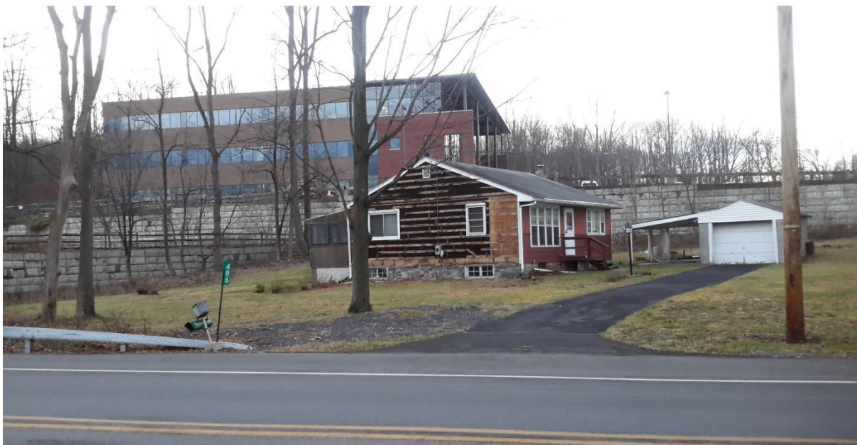
486 East Brown Street East Stroudsburg, Pennsylvania