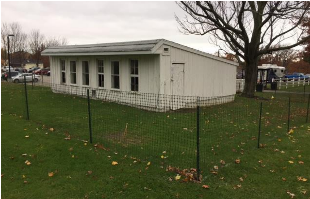
Chicken Coop Edinboro University of Pennsylvania