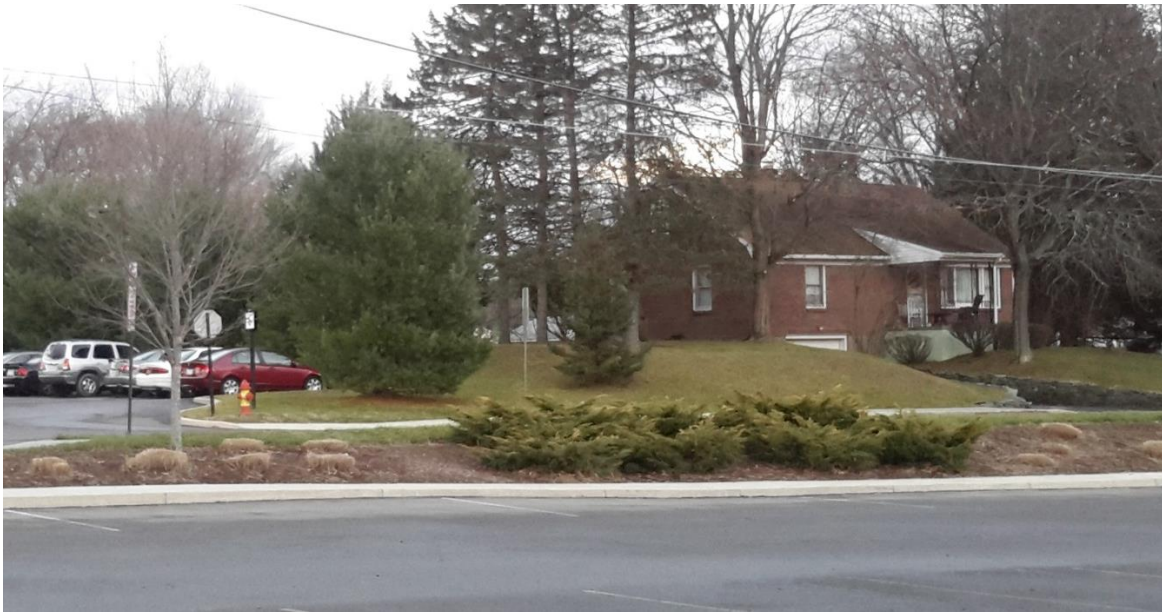
184 Gwendolyn Street East Stroudsburg, Pennsylvania